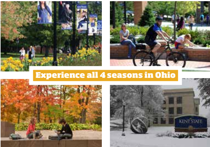
Experience all 4 seasons in Ohio