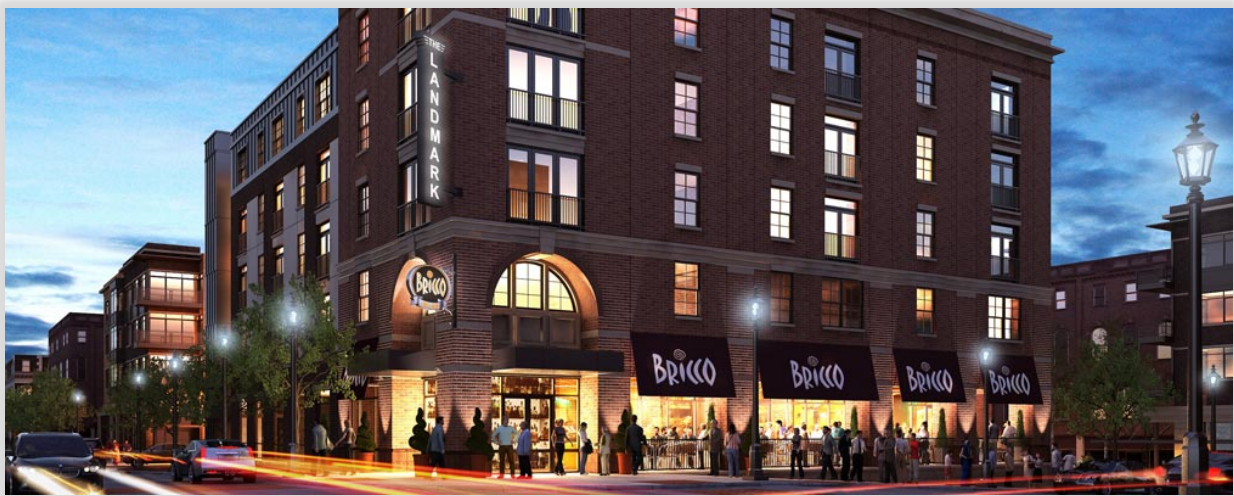
City of Kent, Ohio

Cultural elements in Kent include various arts, environmental and entertainment events during the year as well as the Kent State University Museum, which focuses on the history of fashion design and decorative arts in the U.S. and around the world. The Kent Stage, located downtown, is an iconic venue for a variety of arts performances in music and theater, including concerts, theatrical productions, film festivals and movie premieres. In addition, the City of Kent operates nearly 20 parks and preserves, the largest of which is the 56-acre Fred Fuller Park along the Cuyahoga River. Haymaker Farmers Market is held year-round in Kent and is one of many weekly markets in communities surrounding the university.