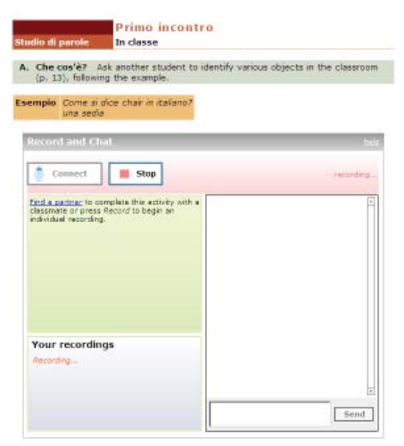
Figure 10: Activity in recording mode