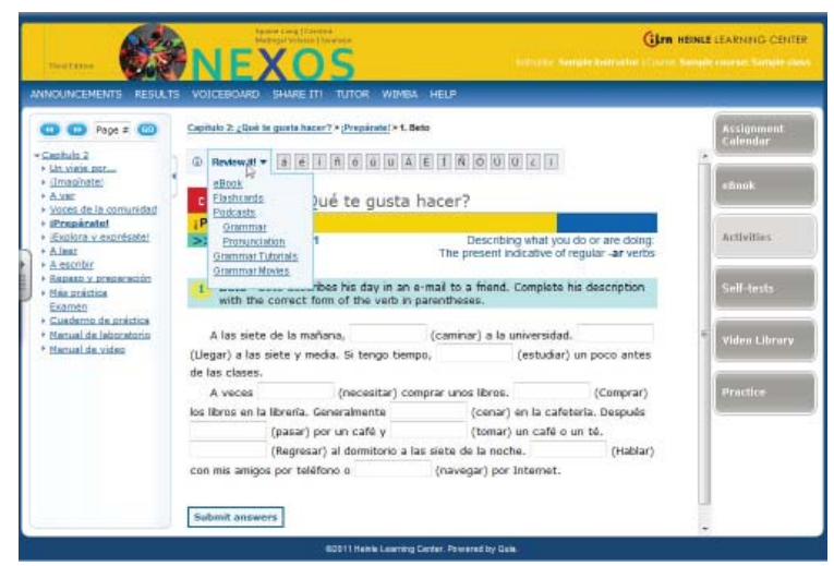
Figure 8: Review it! Button links

The new Review It! button appears with grammar and vocabulary activities and links to relevant resources in the Textbook and Student Activities Manual. Located in the accent toolbar, when a you click the button for an accompanying activity you'll see links to ebook pages covering relevant lessons, flashcards for vocab terms in the activity, podcasts and tutorials that review grammar lessons in the activity, and other resources found in the iLrn for that topic all in one place. This gives will help you learn how to self-correct.