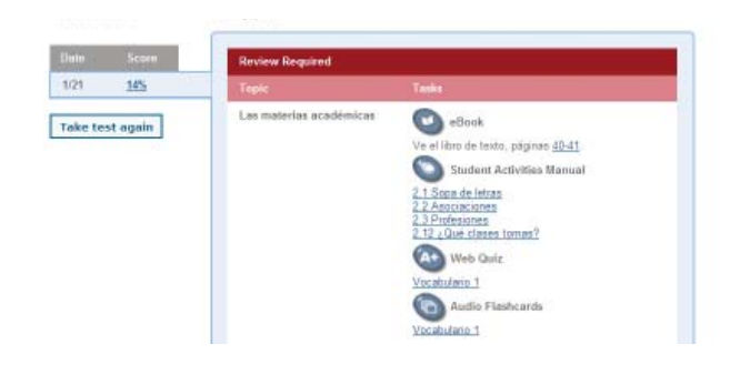
Figure 11: Personalized Study Plan