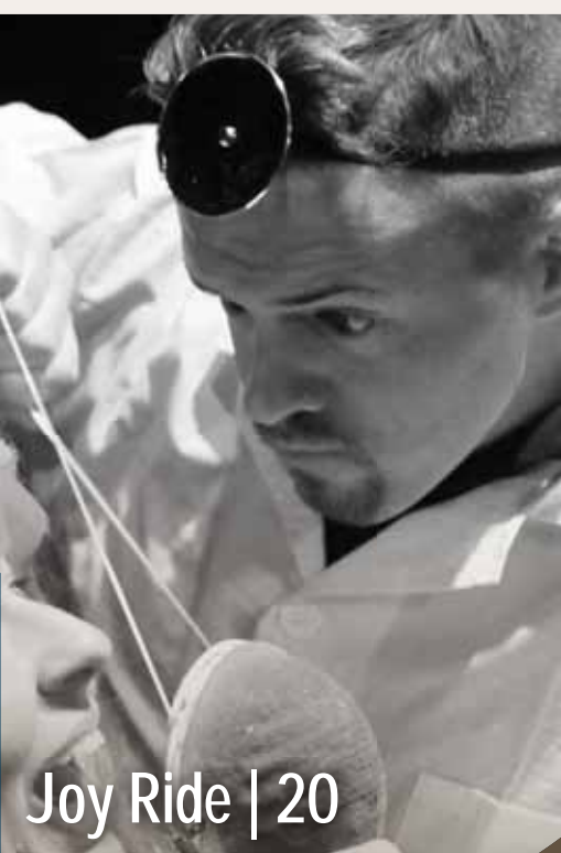
Joy Ride | 20