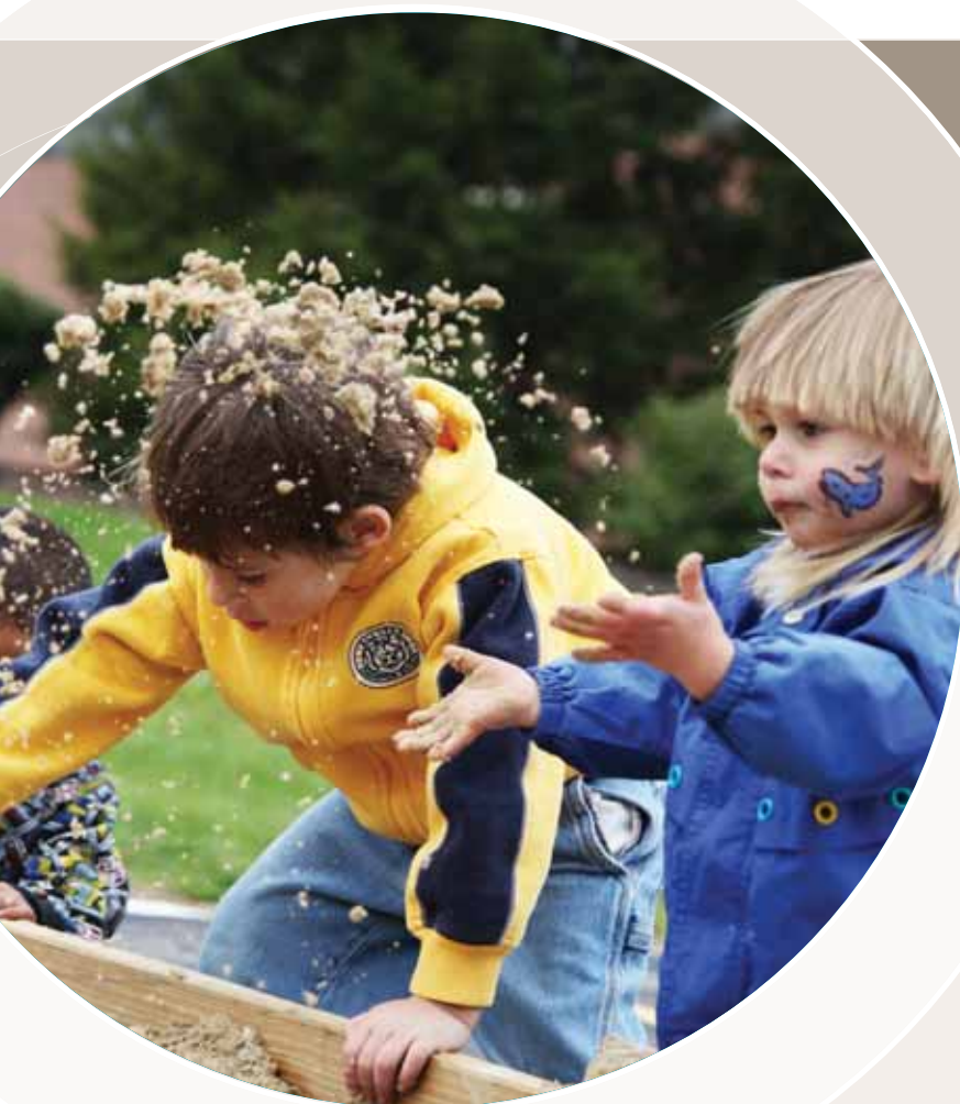
Children dig for "fossils" during the 2012 Earth Day Celebration