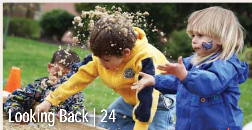
Looking Back | 24