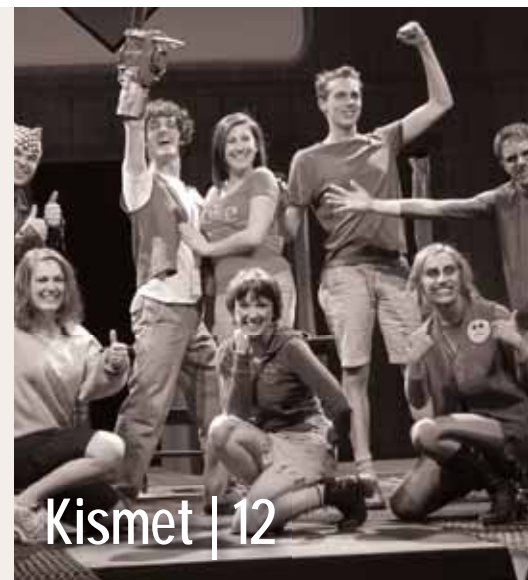
Kismet | 12