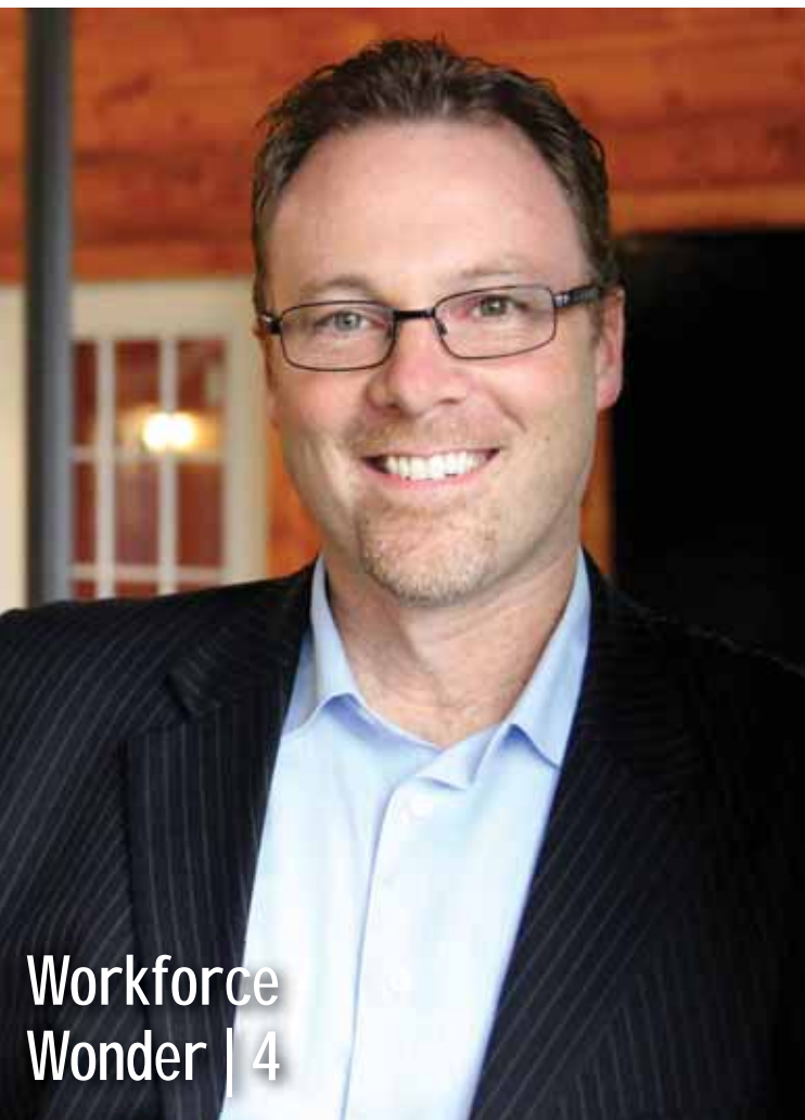
Workforce Wonder | 4