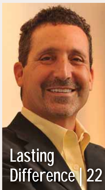
Lasting Difference | 22