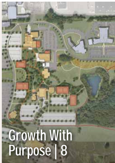
Growth With Purpose | 8