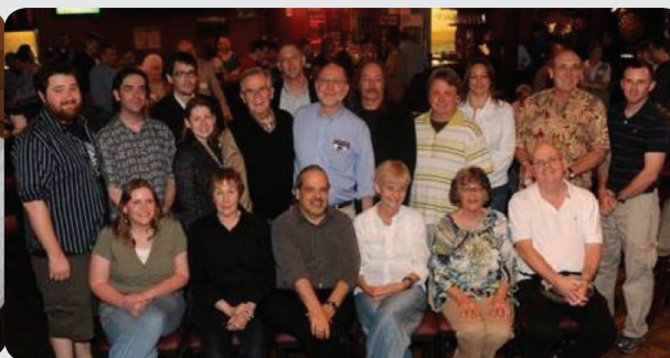
Pictured left to right: