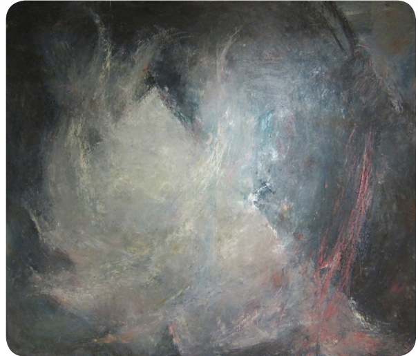
Painting by William Fares: "Deacon" 1985 (Adjacent to Psychological Clinic) 84" tall x 96" wide Acrylic on Canvas