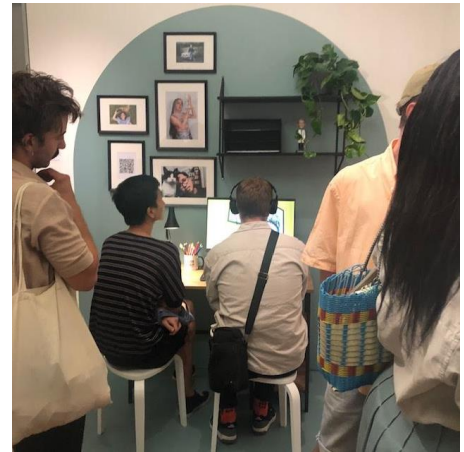
The Queer Pandemic exhibit.