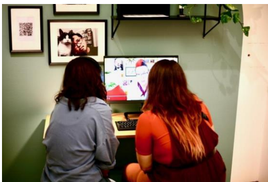
A piece of the Queer Pandemic exhibit.

The US Embassy in London was very impressed with the work and held an event at the US ambassador's residence to "build relationships and further international ties."