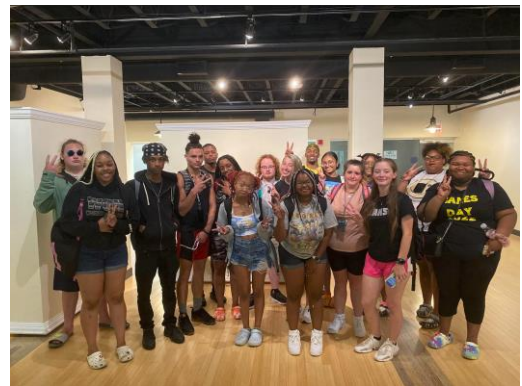
Group photo of 2022's Summer Advantage students.