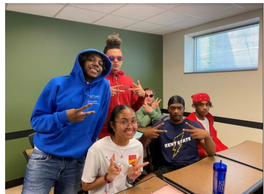
Students in the Summer Advantage program.