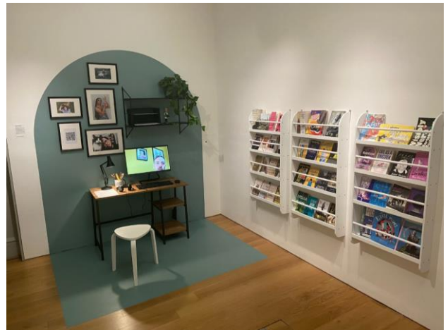
A piece of the Queer Pandemic exhibit.