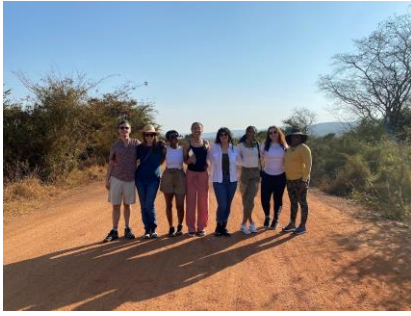
Group photo from a safari at Akagera National Park.