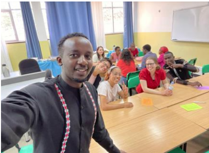
A look at a class on the trip.

The ‘Rwanda After the Genocide Against the Tutsi’ program enabled eleven Kent State students to travel to Kigali, Rwanda for a two-week study trip. Students joined their peers from the University of Rwanda (UR) to learn about the reconciliation process following the 1994 genocide of the Tutsi. This process included attending events and sites dedicated to exploring this topic.