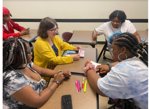
Students participate in community-building activities.

The community-building activities provided students with opportunities to build relationships with their peers. The assessment activities focused on understanding student needs, both academically and socially.