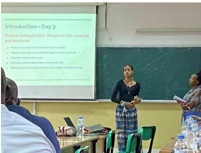
Photo from the capstone experience in Rwanda, where students shared their learning progress with the University of Rwanda community and key stakeholders of the program.