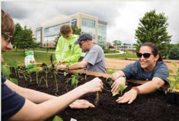
Students are being provided the opportunity to design, plant, water and harvest the new campus garden, located behind the Science and Nursing Building.